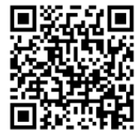
Scan for video "Open Pile Burning vs FireBox Burning"

* Achievable through-put depends on several variables, especially the nature of the waste material, the burn chamber temperature and the loading rate. All weights and dimensions are approximate. Specifications are subject to change without notice. ** Cable-hoist version shown; Hook-lift version is 5" shorter.