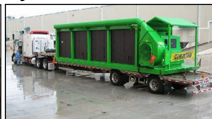
Drop-deck or Flatbed